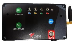
BOX GPS (owned by RDS)